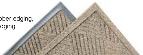
L-R: rubber edging, fabric edging