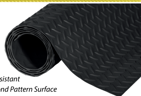
Slip Resistant Diamond Pattern Surface

Applications: factories, warehouses, assembly stations, stock rooms and storage areas